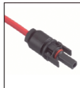
Female Cable Coupler