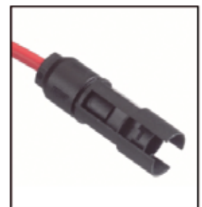
Male Cable Coupler